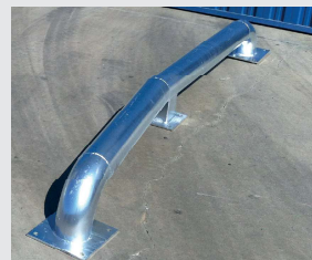
Truck Guides - GC01