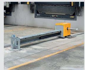
Automatic restraint system - CS51