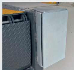
Steel-rubber bumpers - TC05

Inkema offers various accessories that allow its customers to customize loading docks according to their needs and requirements.